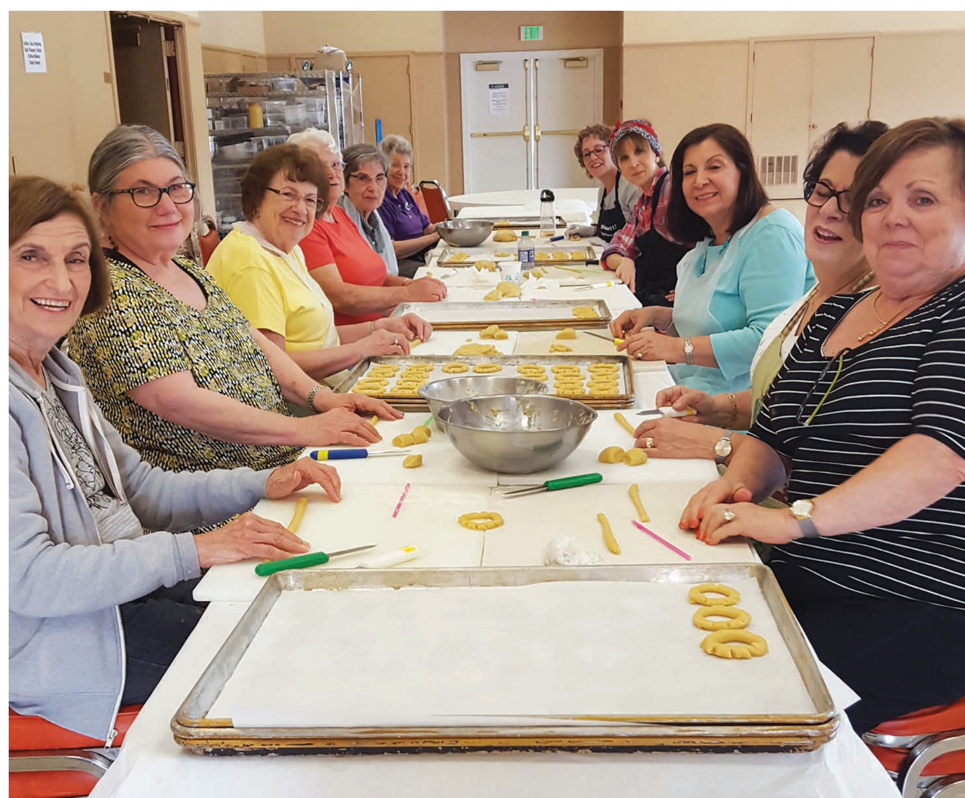
SEATTLE SEPHARDIC NETWORK