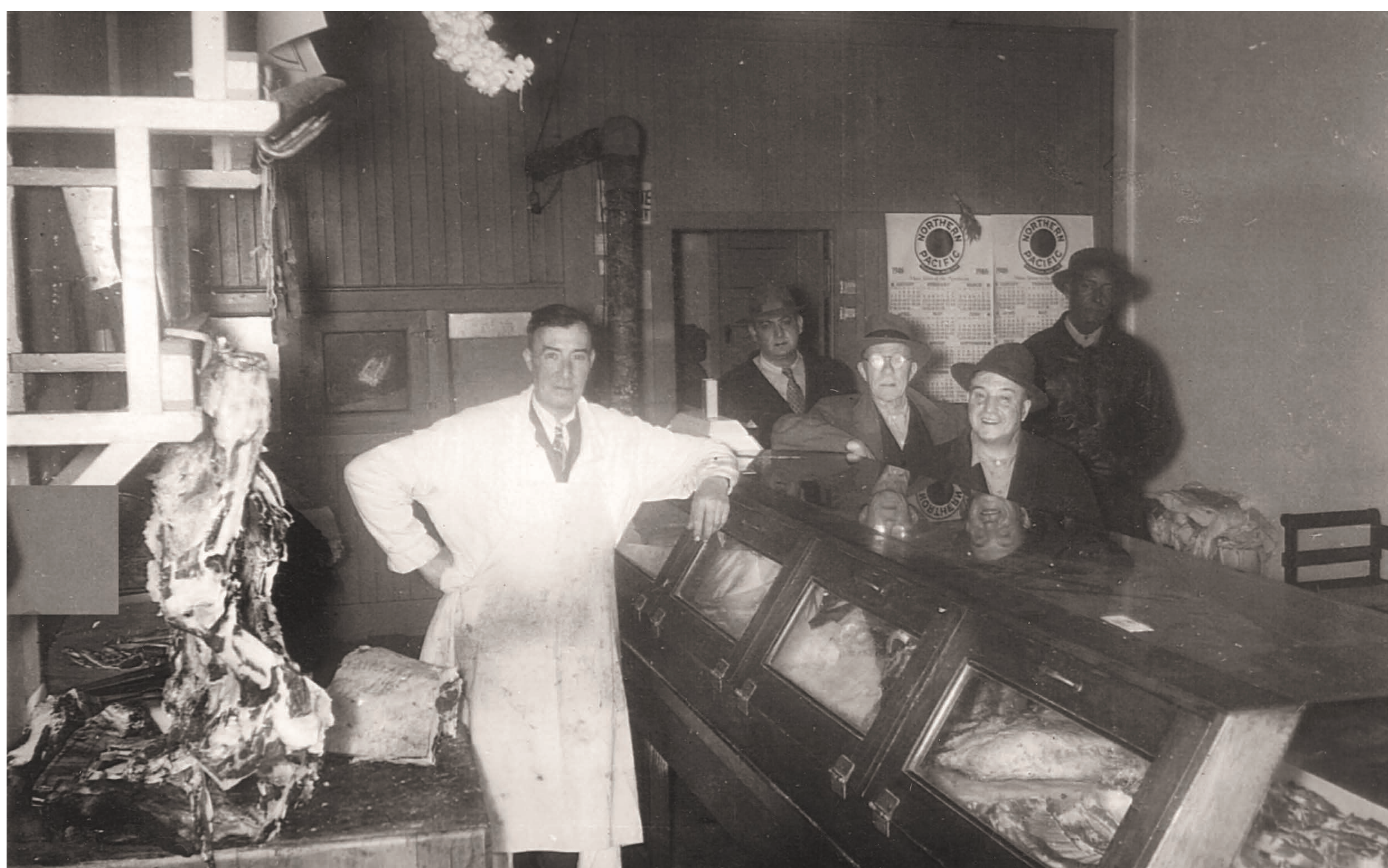
WASHINGTON STATE JEWISH HISTORICAL SOCIETY

During the Great Depression of the 1930s, many merchants generously extended credit to community members, and some stores failed to survive as a result. Stores closed early on Friday and all day Saturday in observance of the Jewish Sabbath, as well as on major Jewish holidays. All other times, the stores filled with chatter and cheer – doubling as gathering places for an entire community.